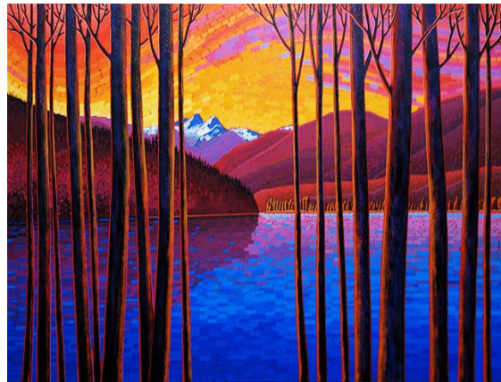
Late Afternoon - Capilano