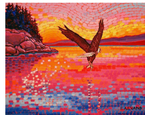
Catch of the Day