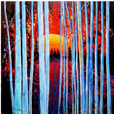
Blue Aspens at Dusk

I paint with bright, bold colours that are applied in "bricks" – each brick integrates with other bricks to form an overall seamless recognizable image. It's a technique I describe as "Brickilism™".